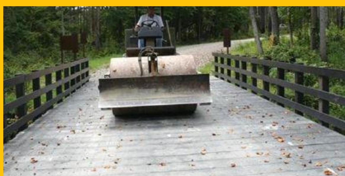
Fort Bragg, North Carolina in 2009