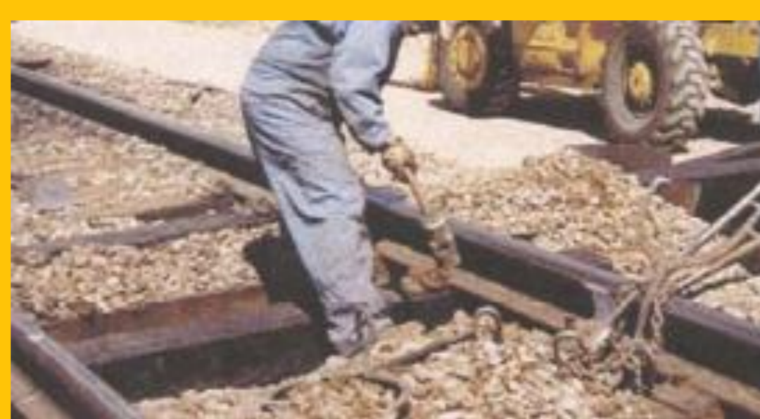
Pueblo, CA in 1996

Although several commercial products on GMP have appeared in recent years, there is lack of published academic work on GMP.