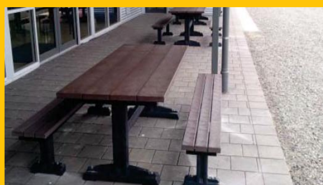
Seating at Xavier College, South Australia