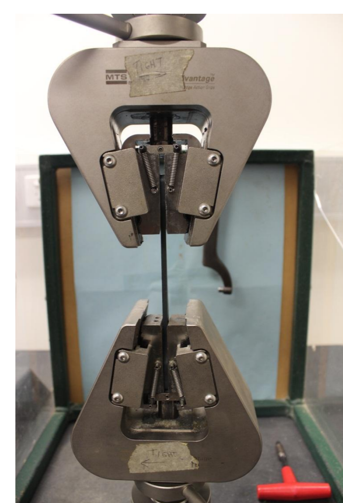
Actual test set-up