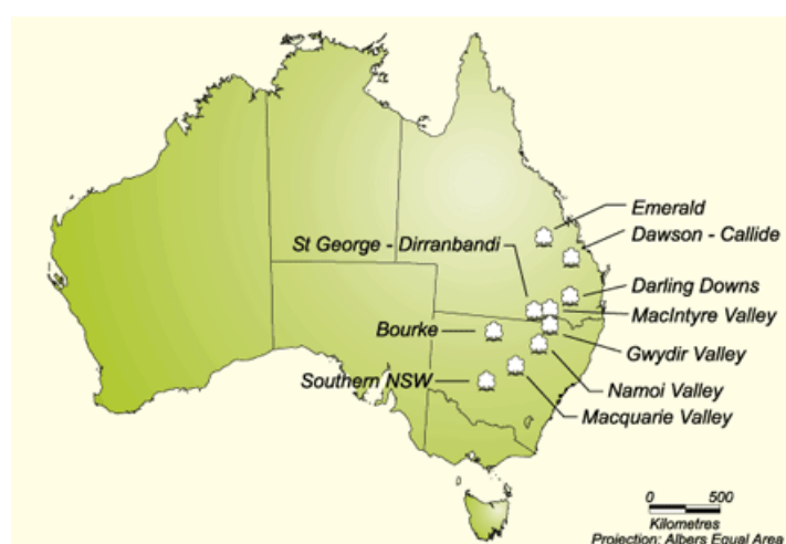
Figure 1: Cotton growing areas of Australia

Agricultural and food production are essential for humans' survival and development. The food production chains, from primary production to consumer and beyond, can have considerable environmental impact. LCA is an internationally recognised approach for evaluating the environmental impacts of products and services. LCA is often used to compare the environmental damages assignable to products and services, and further to choose the least burdensome one. LCA standards are covered by ISO 14040:2006 and ISO 14044:2006.