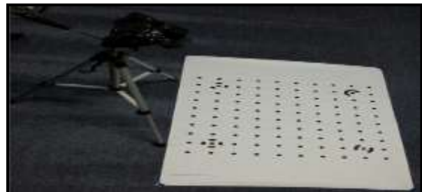
Figure 2. Calibration of Sony DSC F828 camera.

In this study, Sony DSC F828 digital camera was employed to capture the images of test points. As a routine procedure, the camera should be calibrated before can be used for 3D measurement purposes. Figure 2 has shown the calibration procedure carried out for digital camera Sony DSC F828 and the processing of the calibration parameters was made with the aid of Photomodeler V5.0 software. To evaluate the accuracy of 3D coordinates of test points whether good enough to be considered as true value, several scale bars were positioned at the measurement field. One of the scale bar with red ellipse as depicted in figure 1 is used to investigate the accuracy of 3D test points yielded from photogrammetry technique.