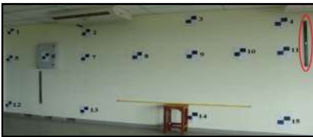
Figure 1. Test points established at calibration field.

In order to investigate the significant of self-calibration to improve the accuracy of TLS data, photogrammetry technique was utilised to establish fifteen test points (figure 1). As mentioned by Luhmann et al. [1], industrial or close range photogrammetry can provide less than millimeter accuracy, which has justified this measurement technique to be selected for determination of true values for those test points.