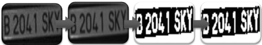
Fig. 2. Outlining the transformation of the image to identify the plate digits

To extract the digits, a similar process was followed. Image 2 show the final result.