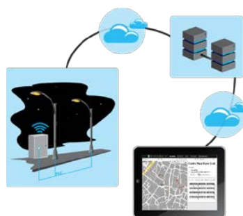
Fig. 1. System Structure

Figure 1 shows the distribution of the elements in the system. On the left side of the image, we can see the street lights on a public road which gather and send information to the server. The user can use a mobile, tablet or PC to connect to the central server and monitor or take necessary action with the street lights through the server. The server will manage the information automatically and will send orders to the street lights according to different schedules.