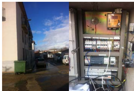
Fig. 4. a) Street with lamps b) Control cabinet

This work has presented the development of a web application to monitor and manage the lighting of different facilities in a smart city environment. The system was deployed in a village of Salamanca. All of the hardware required for management and control is incorporated in the control cabinet and the lights. Figure 4 shows the street and the hardware in the control cabinet. The hardware deployed is: the Echelon SmartServer 2.0 device, which allows the control and coordinating of other devices; the Circutor CVM-MINI network analyzer, which measures the overall system power consumption and a large number of parameters related to the energy consumed; the ISDE ASL-510-TCH controller, which regulates the luminosity according to the order received from the control node; the OSRAM OPTOTRONIC OPt DALI power supply ballast, which transforms the input energy into the correct signal for the LED lamps.