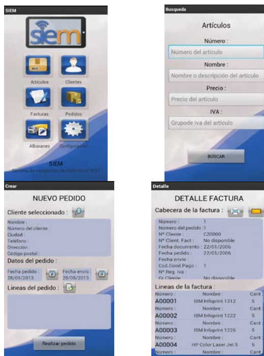
Figure 5: A) Home menu B) Item Search C) New Order D) Bill Detail

The developed application has a set of modules corresponding to the entities and operations of ERP mobilized Figure 5 A) Can be made in different ERP systems management operations such as search items Figure 5 B), search invoices Figure 5 D) orders creation Figure 5 C) and so on.