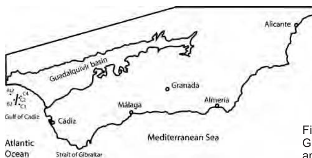
Fig. 1. Map of south Spain, showing the Guadalquivir basin and the location of boreholes and seismic line mentioned in the text.

The Guadalquivir-Gulf of Cadiz basin in Southern Spain is a foreland basin that was originated north of the Betic orogen during the Miocene and Pliocene, north of the Strait of Gibraltar. This basin was always open to the Atlantic and during the Middle to late Miocene it was one of the main gateways that connected the Atlantic and Mediterranean.