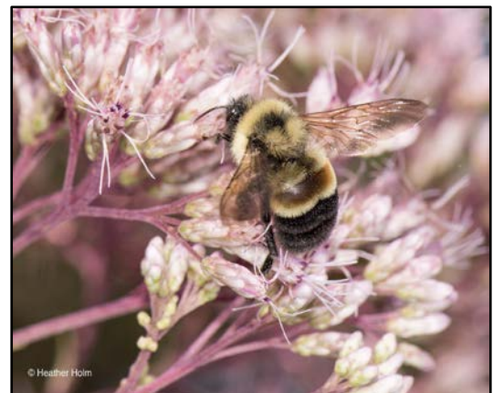
This bumble bee ( Bombus affinis ), which is native to the United States, was recently placed on the endangered species list.