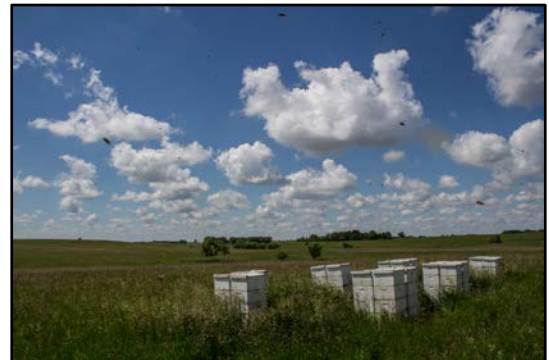
Apiary containing 36 honey bee colonies (4 colonies per pallet) in North Dakota.

The business model of commercial beekeepers mirrors other modern agriculture business models, which is to maximize production in order to meet demand and overcome increasing costs. Unfortunately, these same trends in modern agriculture have adversely affected commercial beekeeping. In the past decade, high commodity prices, biofuel mandates, federal crop insurance, conservation policy changes, and agriculture innovation have helped drive expansion in row crop (mainly corn and soybeans) farming in the Northern Great Plains (NGP) region of the country, where traditionally many commercial colonies spend a significant and critical part of the year (Otto et al. 2016; Wright and Wimberly 2013).