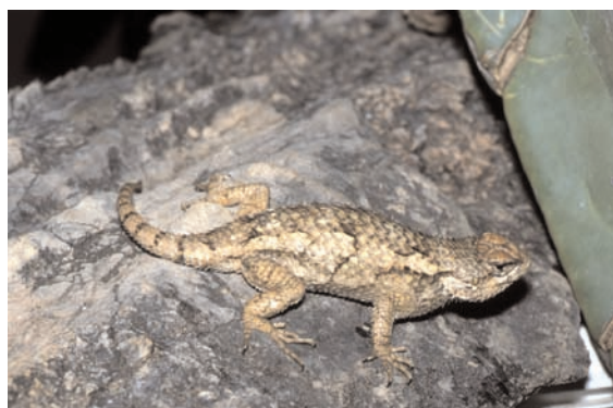
FIGURE 1. Sceloporus edwardtaylori (adult female MZFC 16245) from Oaxaca, Mexico.

• ILLUSTRATIONS. Color photographs appear in