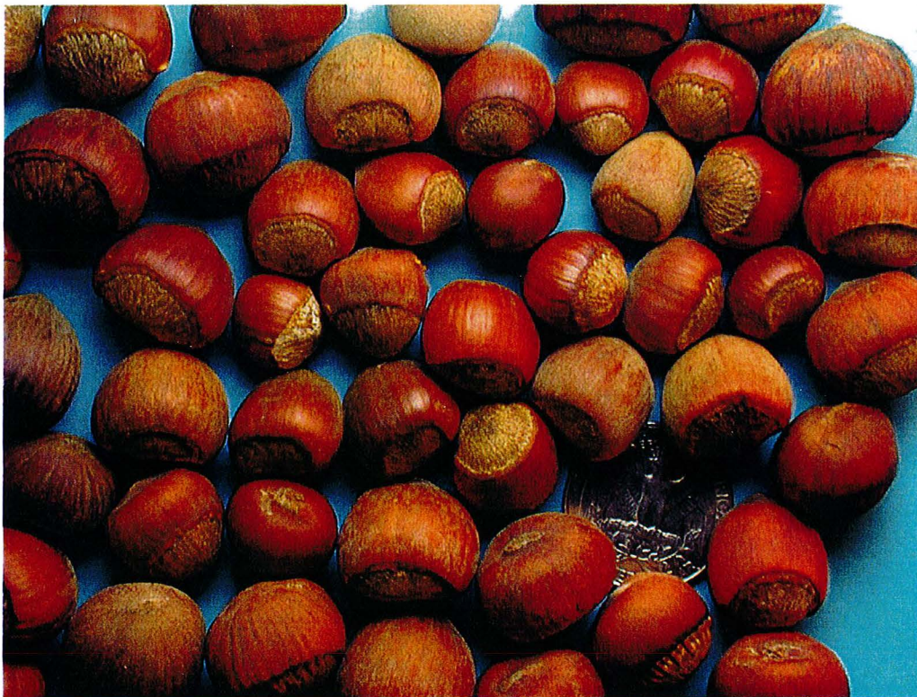
Nuts from the same bush are identical twins in appearance: each different shape and color means a different bush- and a different nut, in taste, chemical make-up, etc.

While production of this handbook has been supported by various universities and government agencies, none of them is responsible for its content, nor are they able to vouch for the veracity of the research findings herein. At the time of publication, Badgersett Research Corporation is the only existing provider of the type of hybrid bush hazelnut plants being discussed here, and is the only entity that has completed long term research on them. We hope and intend that many other people, companies, institutions, and agencies will become involved as the industry grows, and other providers of appropriate bush hazelnuts will develop in the near future. But at the moment, we're it.