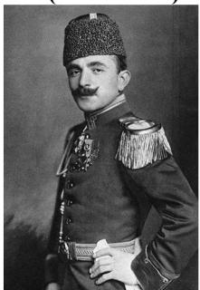
Enver Pasha (1881-1922)