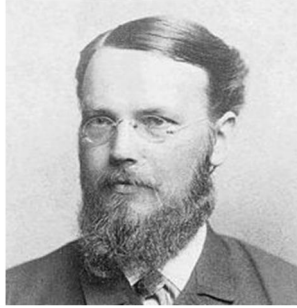
Johannes Lepsius (1858-1926)