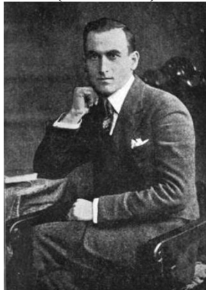
Soghomon Tehlirian (1896-1960)