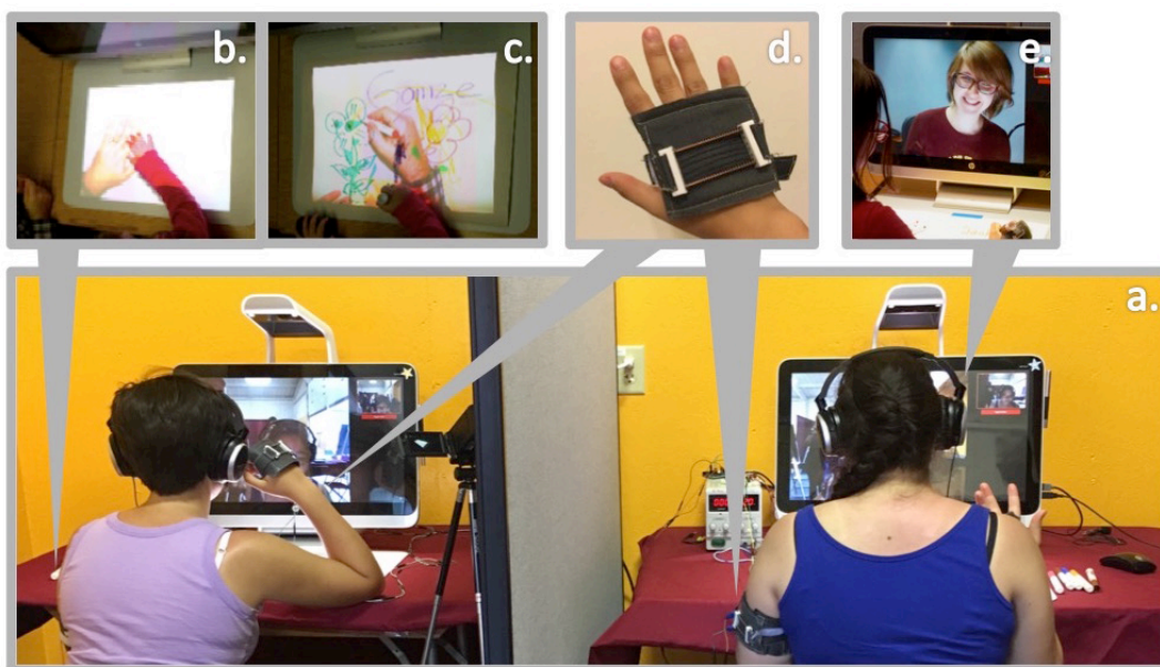
Figure 2. The study setup during the deployment: (a) paired participants sat at tables separated by a wall panel; (b) duplexed projector-camera surface allows for mediated social touch through overlapping video, as well as (c) provides a shared work space; (d) haptic hand and shoulder bands respond to touch gestures with squeezing and heat; (e) the video screen shows a standard face-to-face video chat view and feedback window.