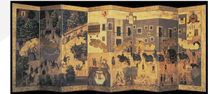
October 19-20, 2007 Asia in Latin America: Across Four Continents Conference