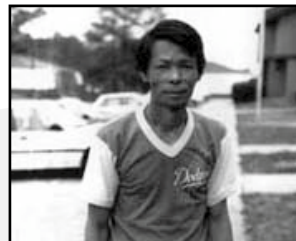
October 16, 2007 Film Screening: Displaced in the New South (1995)