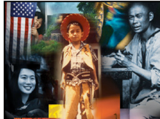
November 27, 2007 Film Screening: No Turning Back (2003)