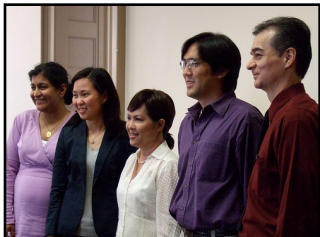
April 3, 2008 Panel Discussion: Featuring Book: Asian Texans (2007) edited by Irwin Tang