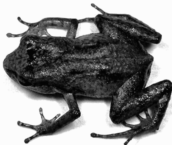
FIGURE 1. An adult Eleutherodactylus thorectes from Peak Formon, Dept. du Sud, Haiti.

Dorsal ground color (in preservative) ranges from tan to dark brown. Dorsal pattern elements are variable, but usually with indistinct dark mottling or blotches, an interocular bar or triangle, and often with at least traces of a scapular X. Other elements may include broad or narrow middorsal stripes, long or short dorsolateral stripes, an eyestripe (consisting of a canthal bar and a supratympanic bar extending to just above the forelimb insertion), and reverse parentheses. Lips may or may not be marked. Upper surfaces of forelimbs are typically mottled, but only rarely crossbanded. Thighs usually have one or more