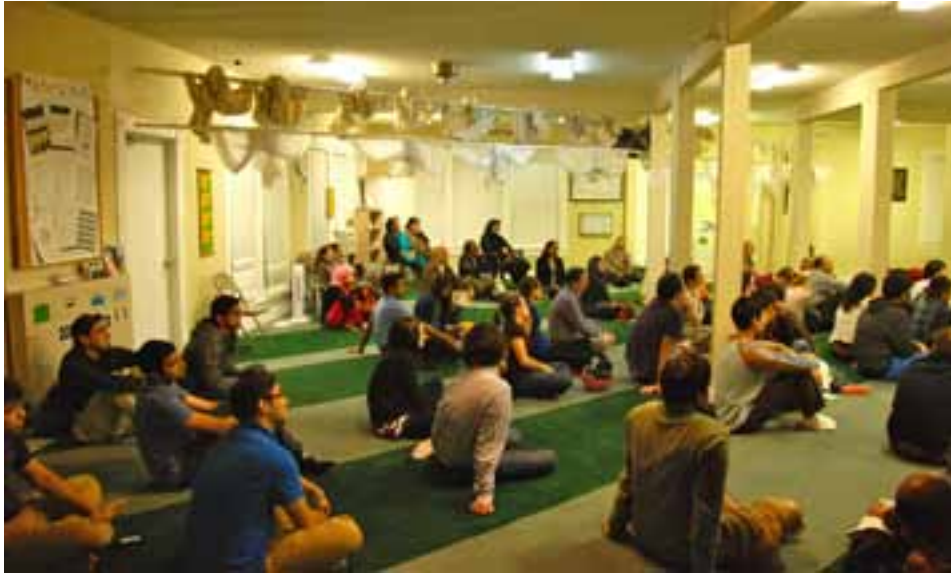
Islamophobia panel discussion held at Nueces Mosque in west campus.