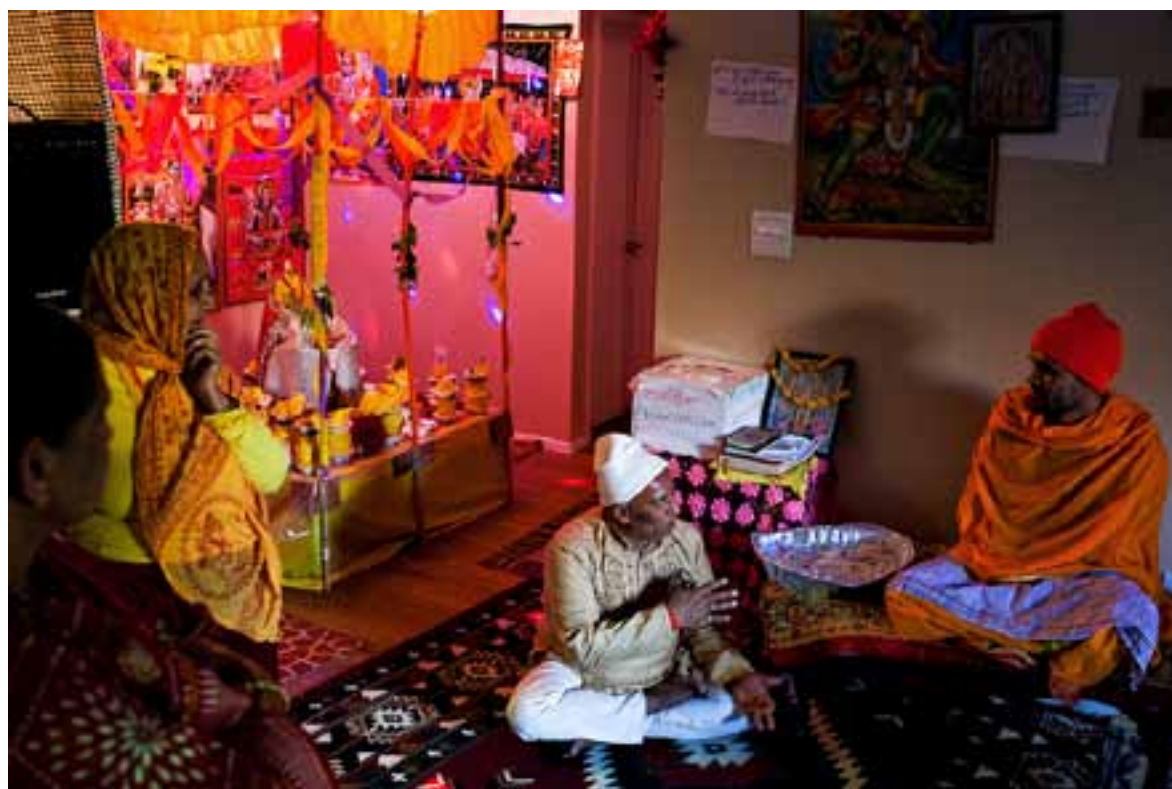
Bhutanese Nepali refugees in Austin, TX.