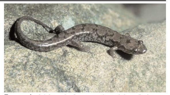
FIGURE 1. Adult male Desmognathus abditus (holotype, MCZ A-135817).

• DIAGNOSIS. Desmognathus abditus most closely resembles D. ochrophaeus and D. ocoee which replace it geographically to the north and south, respectively, in the Cumberland Plateau. Desmognathus abditus and D. ochrophaeus are fixed for alternative variants at 9 allozyme loci (adenylate kinase, E.C. 2.7.4.3; glyceraldehyde 3-phosphate dehydrogenase, E.C. 1.2.1.12; glucose dehydrogenase, E.C. 1.1.1.47; 3-hydroxybutyrate dehydrogenase, E.C. 1.1.1.30; isocitrate dehydrogenase 2, E.C. 1.1.1.42; L-lactate dehydrogenase 1, E.C. 1.1.1.27; malate dehydrogenase, oxaloacetate-decarboxylating; E.C. 1.1.1.38; "leucyl-glycyl-glycine peptidase"; and phosphogluconate dehydrogenase, E.C. 1.1.1.44). Most D. ochrophaeus individuals have relatively straight dorsolateral stripes and larval spots are indistinct or absent in adults of that species. Desmognathus abditus and Cumberland Plateau D. ocoee are fixed for alternative variants at 9 loci (fumarate hydratase, E.C. 4.2.1.2; glucose dehydrogenase, E.C. 1.1.1.47; 3-hydroxybutyrate dehydrogenase, E.C. 1.1.1.30; isocitrate dehydrogenase 1 and 2, E.C. 1.1.1.42; Llactate dehydrogenase 1, E.C. 1.1.1.27; malate dehvdrogenase, oxaloacetate-decarboxvlating, E.C. 1.1.1.38; "leucyl-glycyl-glycine peptidase"; and phos-