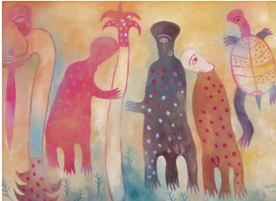
Illustration by Manuel Mendive, courtesy of Arte del Pueblo

and later the first black republic in the Americas (1804), also could give us access to other historical realities that started to define what it meant to be “Indian” or “black” in the Americas. The island of Hispaniola, for example, described by Silvio Torres-Saillant as “the cradle of blackness in the Americas,” was the site where the New Laws (Las Leyes Nuevas) were approved in 1542, changing the conditions of native labor and peoples and granting “humanity” under the Spanish empire encomienda system. 2 While some of the remaining native populations allied with the Spanish colonizers to appease or capture black maroons, other natives escaped along with black maroons into the mountains. When the French part of the island, Saint Domingue, became the richest colony in the Americas, black enslaved Africans who already were “nonhuman” were declared “property” once the laws of the Black Code (Code Noir) were instituted in 1685. After the Haitian Revolution in 1804, Haiti established new geographies of freedom for black peoples in the Americas, while producing forms of political blockage and constitutional disavowal from the United States and Europe. 3 Before we can address the commonalities in the political struggles of Afro-descendant and indigenous groups, therefore, it is important to