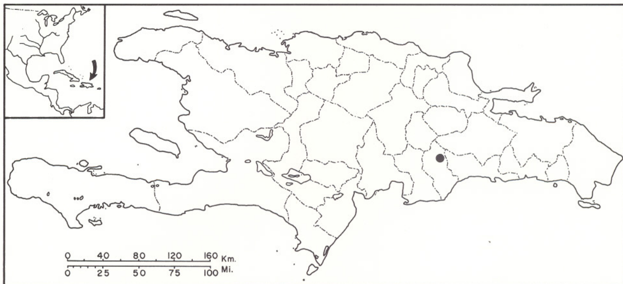
Map. The solid symbol marks the type-locality (only known locality).

Published 15 June 1988 and Copyright ©1988 by the Society for the Study of Amphibians and Reptiles.