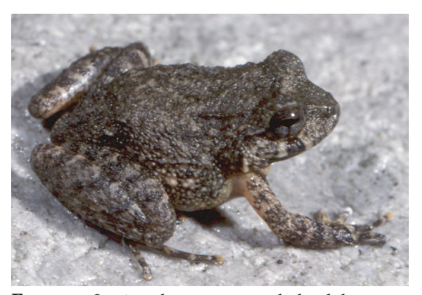
FIGURE 3. Another apparent hybrid between Craugastor fecundus and Craugastor chrysozetetes (USNM 497113) from Quebrada de Oro, Atlántida, Honduras. An adult female with a SVL of 49.5 mm.

DIAGNOSIS. The following combination of characters will distinguish Craugastor fecun dus , a member of the Craugastor milesi species group, from all other Honduran species of Craugastor . A tympanum is indistinct or absent, and an inner tarsal fold is absent. The toe webbing is basal with the modal webbing