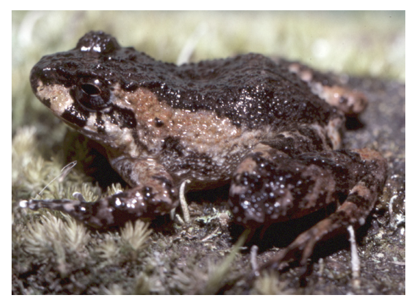
FIGURE 1. Adult female (USNM 497098) of Craugastor fecundus from Quebrada de Oro, Atlántida, Honduras. SVL 33.3 mm. Photograph taken by James R. McCranie on 24 May 1988.

DESCRIPTION. Craugastor fecundus is a small eleutherodactyline (in ten adult males, snout-vent length [SVL] range = 21.1–23.5 mm, mean [standard deviation] = 22.2 mm