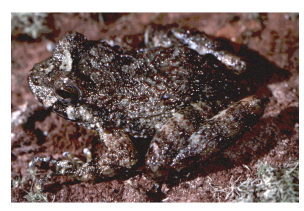
FIGURE 2. Apparent hybrid between Craugastor fecundus and Craugastor chrysozetetes (USNM USNM 497114) from Quebrada de Oro, Atlántida, Honduras. An adult female with a SVL of 38.3 mm.

absent. The subarticular tubercles on the toes are ovoid and globular. Supernumerary and plantar tubercles are absent on the toes. Each inner metatarsal tubercle is elongate, elevated, and visible from above. The outer metatarsal tubercles are small, rounded, and elevated. Relative toe length is I<II<V<III<IV. Each toe disc is definite to narrowly expanded (sensu Savage 1987) with disc on Toe IV about 1.3–1.8 times the width of the digit just proximal to the disc). Disc covers on the toes are rounded (even; see Savage 1987) and the disc pads on the toes are broadened. The modal webbing formula of the feet is I 2-24/5II 2-3\frac{3}{4} III 3-4\frac{1}{4} IV 4\frac{1}{4}-2\frac{3}{4} V. Lateral keels are present on the unwebbed portions of the toes, although weakly-developed fringes are occasionally present on Toe IV of the largest females. An inguinal gland is usually visible on each side.