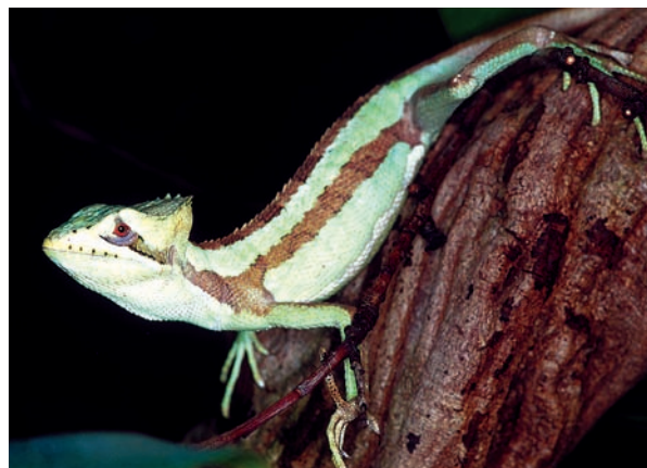
FIGURE. Adult Laemanctus serratus from an unknown location.