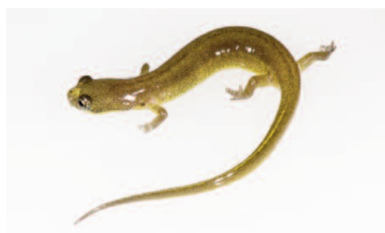
FIGURE 1. Urspelerpes brucei larva (top), adult male (middle), and adult female (bottom).