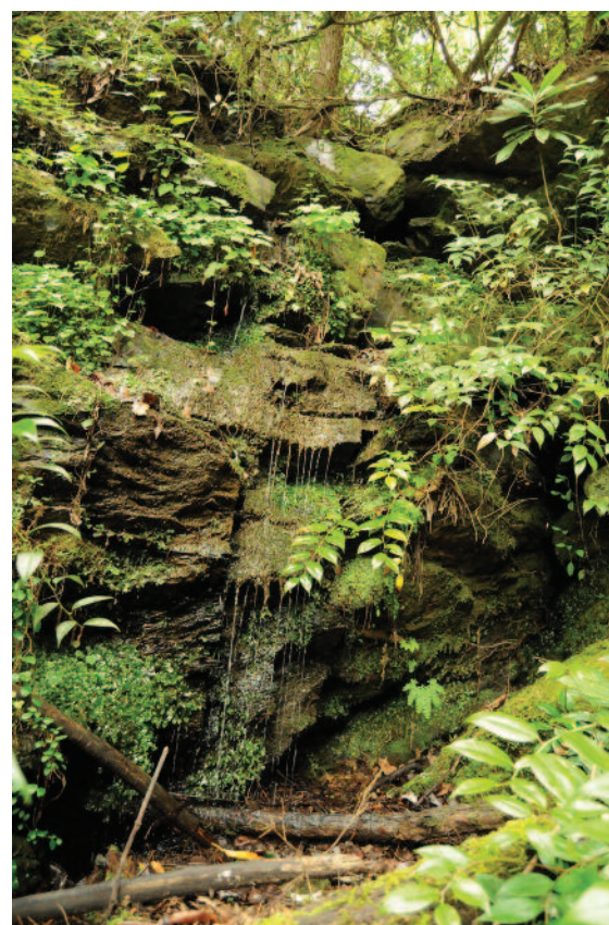
FIGURE 2. Habitat of Urspelerpes brucei .