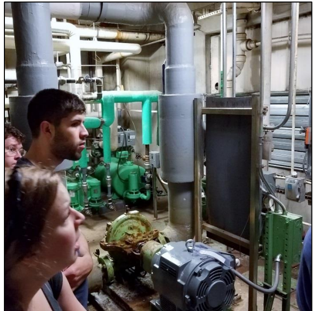
CAEE students get up-close view of UT Austin building systems in operation during facilities tours to support what they learn in class.