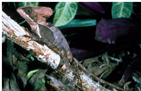
FIGURE. Adult male Corytophanes hernandesii (USNM 520003) from Las Rosas, Santa Bárbara, Honduras.

present. The dorsal head scales vary from smooth to rugose in the frontal region; the scales in the supraocular and parietal regions are keeled. A prominent squamosal spine is present above the tympanum. The nasal scale is single, the nostril is located more or less centrally in the scale, and the opening is directed posterolaterally. The gular scales are elongate and strongly keeled, and the medial row is only slightly enlarged and only slightly serrated. The gular fold is complete and continuous with the antehumeral fold. The dorsal body scales are large, imbricate, and usually smooth. The lateral body scales are imbricate and usually smooth; most lateral body scales are smaller than the dorsal scales. The middorsal scale row is enlarged, forming a serrated dorsal crest with triangular-shaped scales extending from the shoulder region to the base of the tail. The middorsal crest is more prominent anteriorly and not continuous with the low nuchal crest. A serrated row of scales forms an indistinct ventrolateral fold on the body. The ventral scales are large, imbricate, strongly keeled, and usually rounded posteriorly. The subdigital scales are strongly keeled. Caudal autotomy is absent. Femoral and preanal pores are absent.