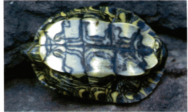
FIGURE. Young male Trachemys taylori from Laguna El Mojarral.

In older individuals of both sexes, melanism is common.