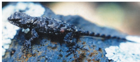
FIGURE 3. A juvenile female S. heterolepis , 31.8 mm SVL, same locality as in Figure 1, 21 July 2001.