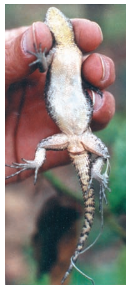
FIGURE 2. Venter of an adult female S. heterolepis from Volcán de Tequila, Jalisco, 2876 m (20°47'42.0"N, 102°50'37.0"W), 8 September 2001. Note the complete absence of both gular and abdominal semeions, sharply different from sympatric S. grammicus , which has at least abdominal semeions.