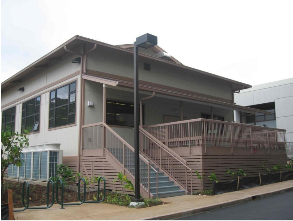
Figure 9: Dance Studio/Venue, outside view.