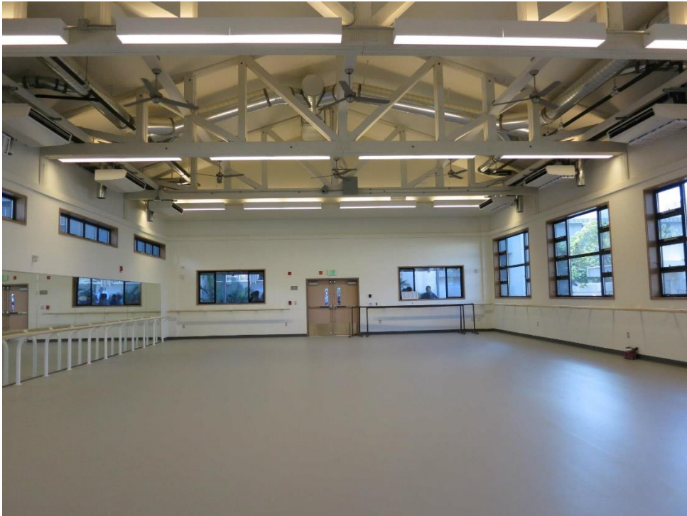
Figure 10: Dance Studio/Venue, inside view.