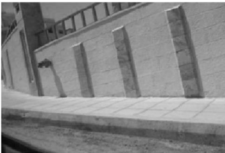
Figure 1. Photo of narrow path entering the Court of Justice.

To begin with parking spaces, nearly 70% of the 30 buildings lacked accessible parking or zero accessibility and only 6 buildings had parking spaces with more than 50% accessibility compliance that matched the ADAAG standards. The same condition was found regarding accessible routes or footpaths connecting the parking to the entrances. The average compliance of the routes was almost absent (0.8%). For example, the width of the route connecting the parking and the newly constructed headquarter of the Court of Justice in Amman was too narrow to accommodate two pedestrians or allow wheelchair users to negotiate the path safely - let alone two wheelchair users meeting each other (Figure 1). The findings imply that construction regulations of buildings suggested by the Jordan's disability law and its relevant NBC were either neglected or ill-defined with regard to accessibility for people with disabilities.