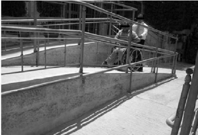
Figure 5. Photo of a substandard ramp in the entrance of HCD main office.

The results are not surprising when it comes to developing countries. The findings of a comparative study carried out by Welage & Liu (2011) for example, show a meaningful difference in the level of accessibility compliance of public buildings among developed and developing countries. The study by Welage & Liu (2011) indicated that the average accessibility compliance of buildings in developing countries including Zimbabwe, UAE, Turkey, Nigeria, and Jordan (added by the authors) is far less than the average accessibility compliance of buildings in the USA (Figure 6).