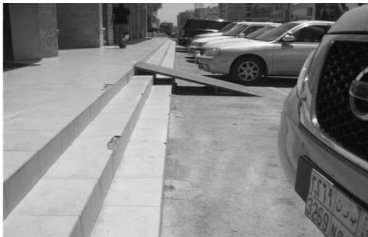
Figure 2. Photo of Iron sheet used as a ramp in a hospital in Amman.

Nearly 80% of the buildings (23 out of the 30) had either substandard or no ramp installed for wheelchair access. For example, in some cases, an unsafe iron sheet with a steep slope was installed as a temporary ramp which was far from being within the required standard (Figure 2). Only 23% of the buildings have provided ramps which were close to the required standards reaching 50-100% compliance.