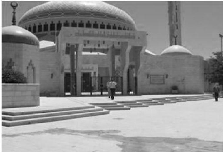
Image 3. Photo of grand mosque with no ramp.

A number of the recreational centers, such as parks, public libraries, mosques, and cinema halls had no ramp at the entry gate, which renders them inaccessible. The Grand Mosque and its toilets and ablution area were inaccessible ( Figure 3). An ablution area is considered as the prerequisite step before entering a mosque for praying. Nevertheless, the condition of internal doors and corridors and their components such as width and handrails were in a satisfactory condition.