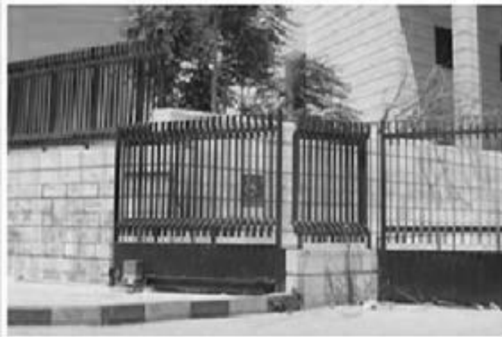
Figure 4: Photo of no ramp to connect the main road to the gate of the stadium.

The stadium was the only recreational area which seems to have an accessible ramp inside the building. However, there was no ramp to connect the main road to the inside ramp beyond the gate that seems to be permanently locked for unknown reasons (Figure 4).