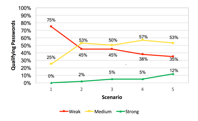
Figure 2. Distribution of the password strength ratings across five guidance-feedback scenarios

based mechanisms may be as a result of the novelty value of the latter approach (i.e. users may have responded more to it because it was unusual, whereas many participants would have been likely to have been familiar with a traditional password meter approach from their experiences in other systems). Nonetheless, the findings as a whole clearly demonstrate positive impact from any of the additional provisions, and so the key lesson is that offering something can pay off.