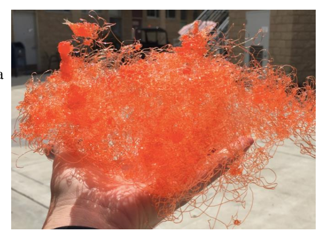
Image Description: Resulting 3D print of Figure 2 graphic. The lack of proper structural elements such as support posts means that the plastic filament produced a messy bird's nest of think plastic string.