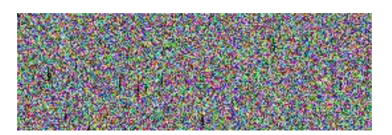
Image Description: Bitmap image made using Fitbit raw data. Each pixel is three sets of hexadecimal values, resulting in a seemingly random, but colorful pattern.

The image in figure 1 is, of course, nothing more than an array of three color pixels—the same as any image taken with a digital camera or scanned into a computer. The only true difference between figure 1 and those images is that the arrangement of pixels in those images make sense to the human brain. One recognizes patterns and sees their grandmother in the photo. In figure 1, I demonstrate the movement that a Fitbit measured from my wrist over the course of 30 days. Is this an any more "true" representation of me than the decoded step data uploaded via the Fitbit program on my laptop? Does it provide any more insight into my EDS than the line graph tracking my sleep cycles on Fitbit.com? It does not.