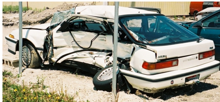
Figure 2 Photograph of Douglas Kidd's car after the accident. One can see the massive damage that was caused by the collision

The consequences of the accident were devastating. Major injuries I sustained included: multiple hip fractures, a crush injury with compartment syndrome (increased pressure in a muscle compartment that can lead to muscle and nerve damage as well as blood flow problems) to my lower right leg, ruptured spleen, bleeding behind my abdomen, lacerations to my liver and rectum, and two cardiac arrests (one at the scene, the other soon after arrival in ER). The most significant injury occurred as my head absorbed enormous energies from the SUV and my brain hemorrhaged severely. Days later while in ICU, a deadly methicillin-resistant staphylococcus aureus (MRSA) infection took hold. I came so close to death from MRSA, and survived, staff at the rehabilitation hospital referred to me as the “miracle man.”