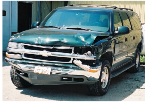
Figure 1 Photograph of the minor damage to the SUV after the accident