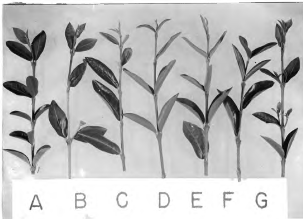
FIGURE 3. DEFORMATION OF LEAVES OF ACEROLA CAUSED BY APPLICATION OF GROWTH REGULATORS OF THE PHENOXYACETIC ACID SERIES. A. CONTROL, B. PHENOXYACETIC ACID, C. O-CHLOROPHENOXYACETIC ACID, D. P-CHLOROPHENOXYACETIC ACID, E. 2,4-DICHLOROPHENOXYACETIC ACID, F. 2,4,5-TRICHLOROPHENOXYACETIC ACID, AND G. 2,6-DICHLOROPHENOXYACETIC ACID.