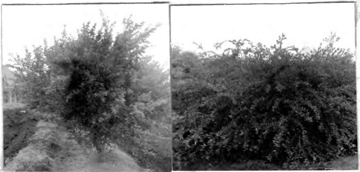
FIGURE 1. TYPES OF GROWTH OF ACEROLA.