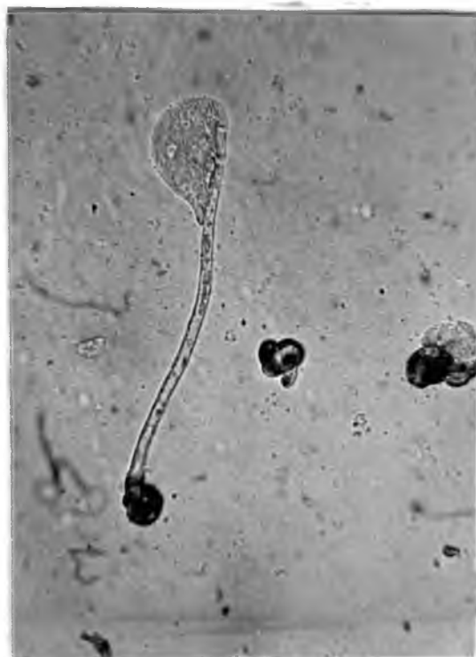
FIGURE 2. GERMINATED POLLEN GRAIN OF ACEROLA WITH VISCOUS EXUDATE ON TERMINAL OF GERM TUBE (170X).