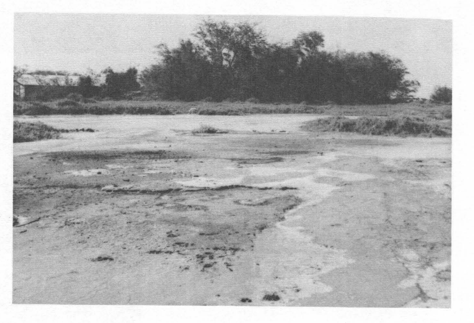
Figure 2. Small variations in land elevation can result from improper levelling. Spottiness in salt-affected soils is associated with differences in elevation because salts tend to move to higher localities through capillary activity.