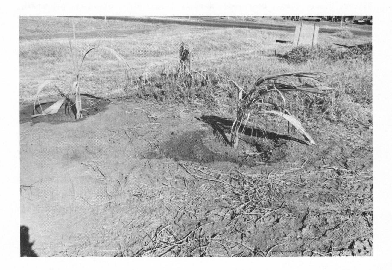
Figure 4. Plant establishment is usually the critical stage which may determine the success or failure of a new planting in saltaffected areas, whether the salt originates in the soil or the water. These coconut seedlings show signs of need for special irrigation management for modifying salt effects.

Plants differ widely in their ability to tolerate salts in the soil. Proper selection of plants is an essential part of successful management of salt-affected areas. Many investigators have evaluated the salt tolerance of a wide variety of plants in both field and greenhouse research. In vegetable, field, forage, and fruit crops of high economic significance, the main index for tolerance was the extent of reduction in yield. Published salt-tolerance values are based upon the conductivity* of the soilsaturation extract at which a certain percent yield decrement may be expected, based on yields when the plant is grown on a nonsaline soil under