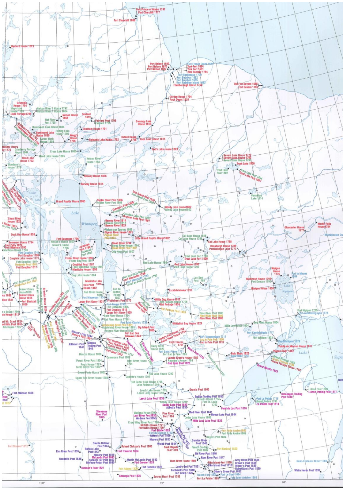
FIGURE 2: MAP: POSTS AND FORTS OF THE CANADIAN FUR TRADE 1600-1860