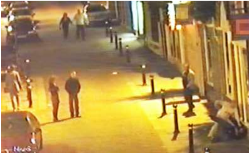
Figure 1a. On the bottom right-hand side, a man dressed in a white shirt assaults another man who is on the ground. Some bystanders observe.