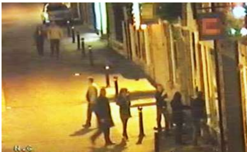
Figure 1c. The two bystanders are joined by others. A male bystander in a dark shirt and jeans pulls the main aggressor from his target, while a female bystander steps between the conflict parties and extends both arms out in a blocking motion.