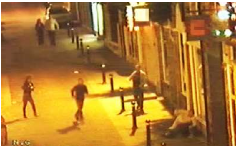
Figure 1b. To the bottom left-hand side, two bystanders leave their standing positions and approach the conflict parties.