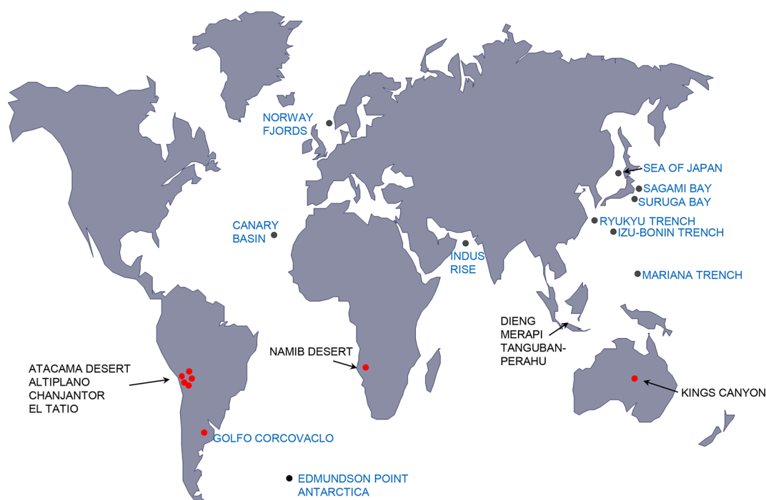
Fig. 1. Global distribution of extremobiosphere sites sampled during 1992–2017.

Our bioprospecting campaigns have targeted major extreme biomes and within them distinct sites displaying various degrees of environmental extremities. Thus, the choice of deep sea and desert biomes provides strong selective pressures, for example in hyperbaric pressure and aridity respectively, that determine the composition of their actinobacterial communities. Fig. 1 shows the global distribution of extreme biome sampling sites that we have researched and which, in addition to the principal focus on deep seas and deserts, also has included polar, thermal and volcanic environments. Specific details of these sites are given in Table 1, where the range of altitude over which our 'bioprospecting campaigns'