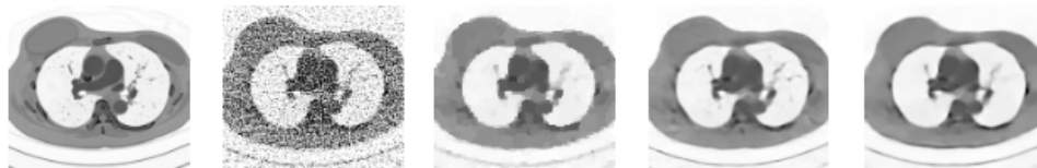
(a) Ground Truth (b) FBP (c) TV (d) Post-Processing (e) Adversarial Reg.