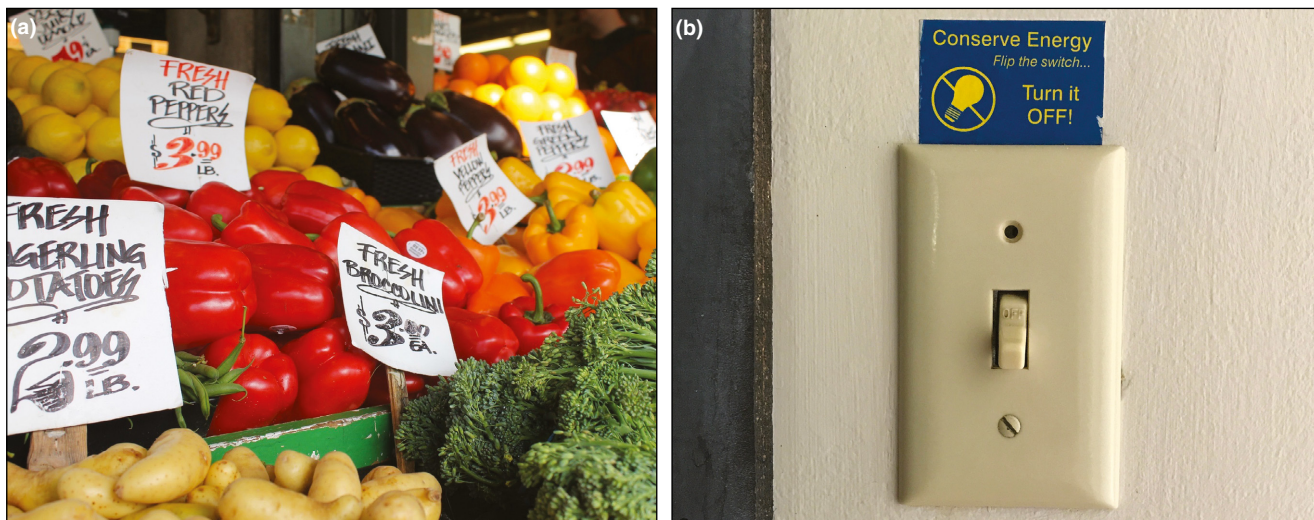
Figure 2. Examples of using priming and salience to influence behavior. (a) Displays of healthy foods prime shoppers to purchase healthier food items; (b) reminders and prompts make energy use and conservation salient.

options available to policy makers and those designing conservation programs.