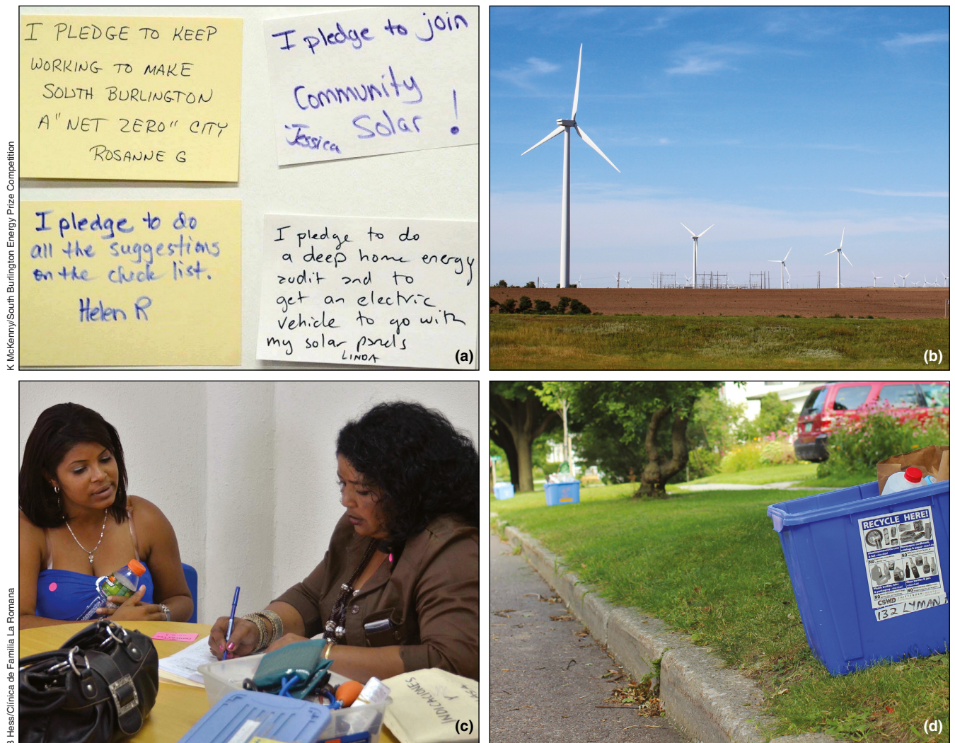
Figure 1. Examples of targeting contextual variables to increase pro-social and pro-environmental behavior. (a) Pledges elicit commitments that spur action to reduce energy use; (b) automatically enrolling consumers in green energy programs increases participation compared to a default where people must opt in; (c) health information is more effective when the messenger suggesting the behavior change is perceived as similar; (d) the behavior of peers and neighbors indicates social norms that promote recycling.

tion, these contextual variables often moderate behavior through automatic, unconscious cognitive processes (Dolan et al. 2012).