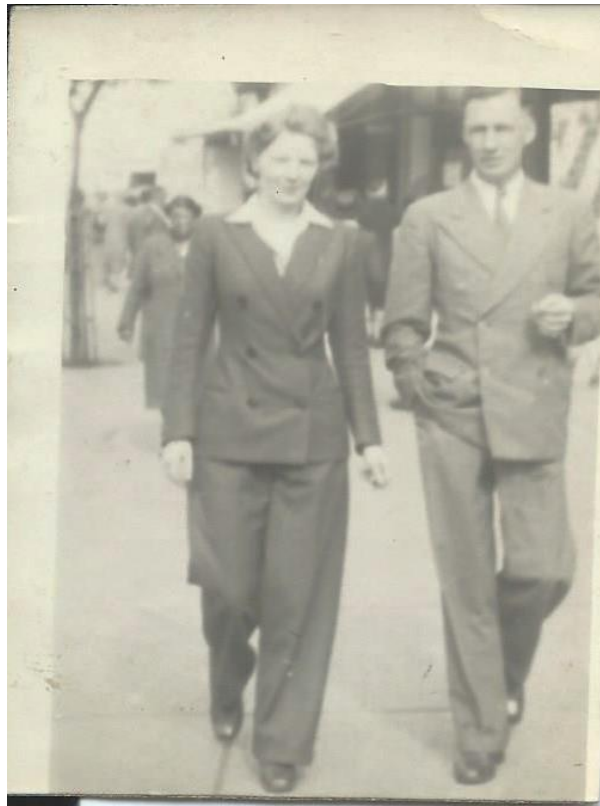
Largs, July 1943

Street photographers were a feature of seaside towns in Britain from the 1850s until the 1950s and beyond. Their heyday was in the 1930s. On the August Bank Holiday of 1939, the fifty ‘reflex men’ working for Sunbeam Photos of Margate took 35,000 photographs of holidaymakers and day-trippers (Harding 2013). The typical image was the ‘walkie’, in which the subjects were snapped as they walked along the promenade, and then handed a receipt so that they could purchase the image from a shop or stall once developed. The photos might be retained as keepsakes or sent to a friend as a holiday postcard.