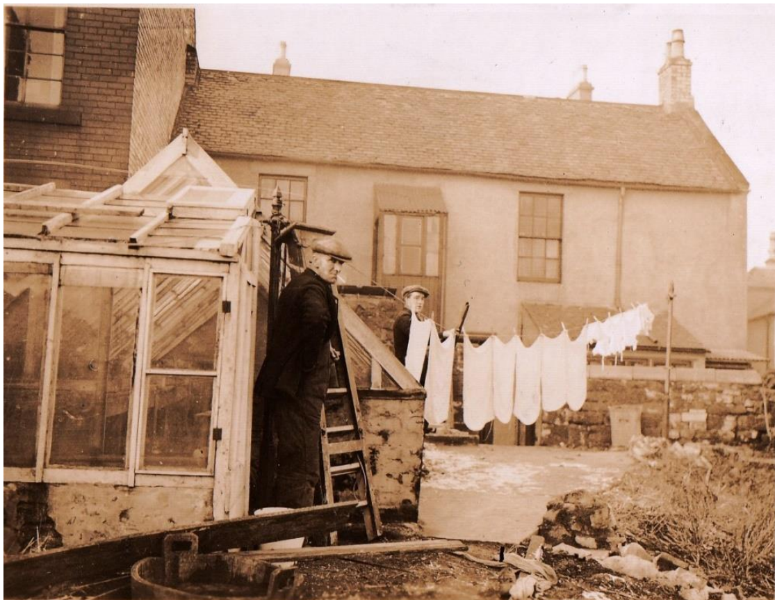
Area 7, Dean Lane & Boyd Street

tiny jubilations, as if they referred to a stilled center, an erotic or lacerating value buried in myself (however harmless the subject might have appeared)' (2010: 16). The photographs I have been using are largely unseen, chosen only to be wedged into cardboard corners on the pages of one green leather album, curated only in that they were jumbled together in folders in a decaying box in an archive. But these too can spark, 'an internal agitation, an excitement, a certain labour too, the pressure of the unspeakable which wants to be spoken' (2010: 19). I have felt it in the striped socks worn by the small boy in the background of a photograph taken in the garden of a house called Kirkton in East Kilbride, in the lilies ill-chosen as a wedding bouquet by an unsmiling bride, in the vast shadow of a coach-built pram being wheeled across a lawn pictured from above on VJ Day. That which wants to be spoken takes many forms. It might be a bubbling up of inherited narratives, the flickering of inspiration, or the recognition that we have seen is common to all photographs of people but that we rarely articulate: this has been and this will be. 29