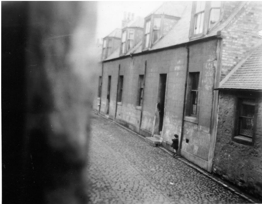
No 15 & 17 Boyd Street