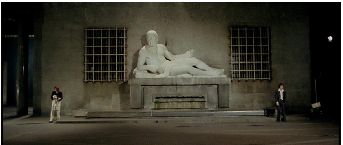
Figure 5.11 – Marc (left) and Carlo as inversions of one another.