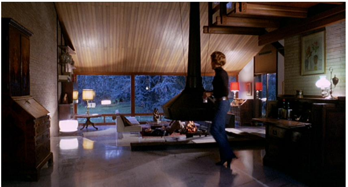
Figure 3.4 – Andrea’s cramped, austere kitchenette (above) contrasted with Helene’s expansive and inviting living room (below).

Around halfway through the film, a furious argument occurs between Andrea and Traversi, with Traversi letting his employee know just what he really thinks of him. His tirade ends with a stark assessment: “You’re not the man you were, Bild.” While superficially a reference to Andrea’s drinking and consequent loss of self-discipline, when taken in conjunction with his interaction with Helene and the images of imprisonment scattered liberally throughout the film, this statement can be read more broadly in relation to the perception of masculinity as having been negatively transformed by the advancement of women’s rights and the creeping spread of the concrete jungle. Through his drinking,