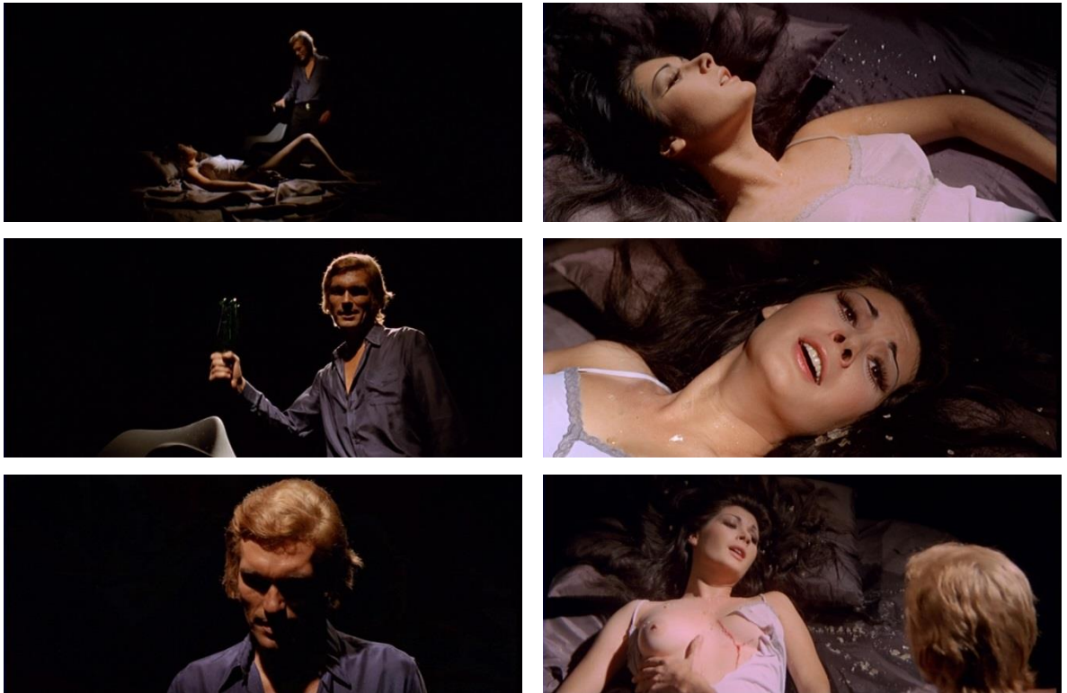
Figure 4.4 – Mise en scène emphasises Julia's passivity.

In addition to this scene, Julie's passive role is vividly conveyed in the second of the two flashback dream sequences recounting her past. In this sequence, Julie lies on a bed as Jean pours wine over her, then proceeds to smash the bottle and use the jagged stump to rip open her negligée, cutting her in the process. Quite apart from Julie's inherently masochistic role in this dynamic (which, it is alleged on numerous occasions, she at least partially enjoyed – Jean describes her as having “a blood fetish that turns her on”, and George claims that blood “excites and repels her at the same time”), the way in which the sequence is shot also underscores her powerlessness. A long shot shows Julie lying below Jean, unmoving and submissive, while subsequent high-angle close-ups show her staring up at the camera in terror, frozen like a rabbit in the headlights. These close-ups emphasise her overall passivity and her position of helplessness, which is further underscored when Jean opens her torn negligée, exposing her breast and increasing the sense of her vulnerability. Meanwhile, the intercut shots of Jean, photographed from a low angle, emphasise the control he wields over her. (See Figure 4.4.)