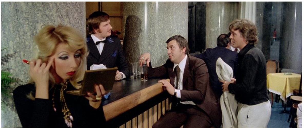
Figure 5.12 – Femininity as performance: the killer (top) and an unnamed extra.

The presence of this extended cast of characters whose behaviour or appearance marks them as queer is only intensified by a number of elements which, while not directly related to gender or sexuality, help convey the film's overwhelming sense of strangeness and hyperreality. This otherness fits hand in gloves with the film's challenging of traditional gender boundaries, which, while not grotesque in the manner of a character like Dorsey in The Pyjama Girl Case , does provoke a sense of pronounced unease. Just as film noir conveys a sense of "strangeness" with its "unbalanced composition" and "skewed camera angles" (Dyer 1977), Deep Red itself effectively becomes queer by virtue of the variety of ways in which it usurps many of the giallo 's conventions, disorienting the spectator. This is signalled as early as the film's opening credits, where the stark white-on-black titles and jazz-rock score are interrupted midway through by the sound of a children's lullaby and violent screaming as the image of a living room adorned with Christmas decorations fades in. Two silhouettes are projected against the far wall, one repeatedly stabbing the other. The victim's silhouettes falls to the ground, while their attacker moves out of shot. A