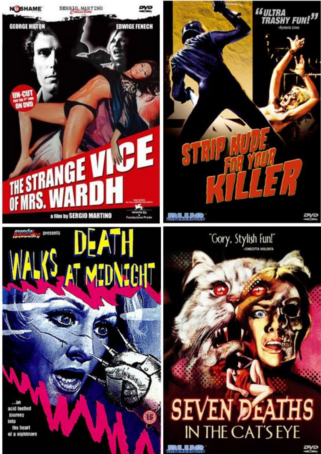
Figure 1.1 – A selection of giallo DVD covers.

Additionally, many DVD releases augment their lurid artwork with claims of “explicit sex” and “graphic violence” in the blurbs on the back covers. “ The Fifth Cord [Bazzoni 1971] has it all,” declares Blue Underground’s release of the film: “kinky sex, shocking violence [...] and much more.” Another Blue Underground release, The Pyjama Girl Case