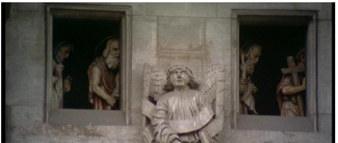
Figure 3.7 – Literal statues, part of the city itself, never to escape.

A similar effect is created later in a scene set in the city's Old Town Square, in which the camera focuses on a variety of humanoid sculptures and figures carved in stone, the latter moving around on a mechanical apparatus, the banality and lifelessness of their movements echoing that of the city's inhabitants (see Figure 3.7).