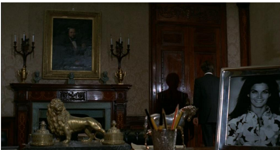
Figure 4.3 – The two Carols: black (top) and white (bottom).

In her analysis of Alfred Hitchcock's noir -infused melodrama Rebecca (1940), Modleski argues that the reason the character of Rebecca cannot be tolerated is her multiplicity: her ability to both play the part of the model wife and to engage in multiple extramarital affairs (1988: 54). By the same token, it is Carol's use of one persona, i.e. that of an innocent victim, to conceal her real nature as a duplicitous killer that seems to most offend Inspector Corvin's sensibilities when he finally confronts her with the truth. Corvin concludes spitefully that she is "nothing more or less than a murderess", his use of the highly gendered term "murderess" rather than the neutral 'murderer' creating an indelible link between Carol's femininity and her duplicity. The two Carols are therefore not the product