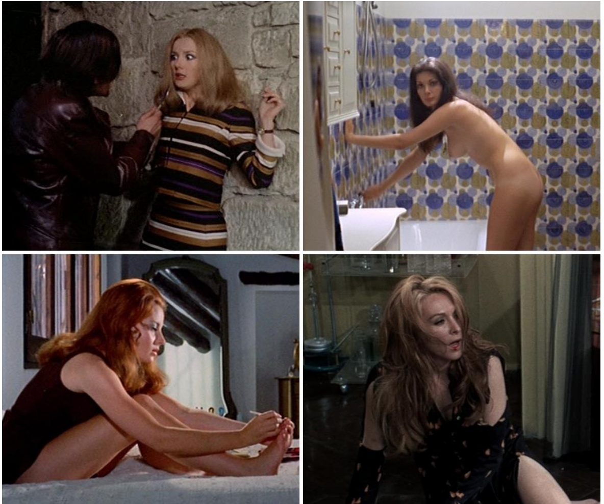
Figure 4.1 – Collage of F-giallo central women: Barbara Bouchet in The Red Queen Kills Seven Times , Edwige Fenech in The Strange Vice of Mrs. Wardh , Dagmar Lassander in The Forbidden Photos of a Lady Above Suspicion and Nieves Navarro in Death Walks at Midnight .

Figure 4.1, above, shows a number of giallo central women in situations typical of the role. The selection of these images is, to a certain extent, deliberately provocative – as are the films themselves, which put considerable emphasis on the central woman being placed in situations which maximise her erotic appeal and victim status. As such, the central woman is frequently to be seen being terrorised by ruthless, knife-wielding attackers (Figure 4.1, above left), in a state of undress (above right), or bloodied, battered and beaten down, often with her “fabulous outfit” torn to shreds (below right). Typically, she is either unemployed or has a job that requires a minimum level of commitment, allowing plenty of free time for sightseeing, parties and contemplating her boredom with la dolce vita . As Kier-La Janisse notes, “[t]he lifestyle depicted in most gialli is one of leisure: women are seen lying down – wearing muumuus, lingerie or other items of lounging attire that imply that they don’t leave the house much – more than they are seen standing up” (2012: 38). The films feature copious scenes in which the central woman relaxes in her swank, modish apartment,