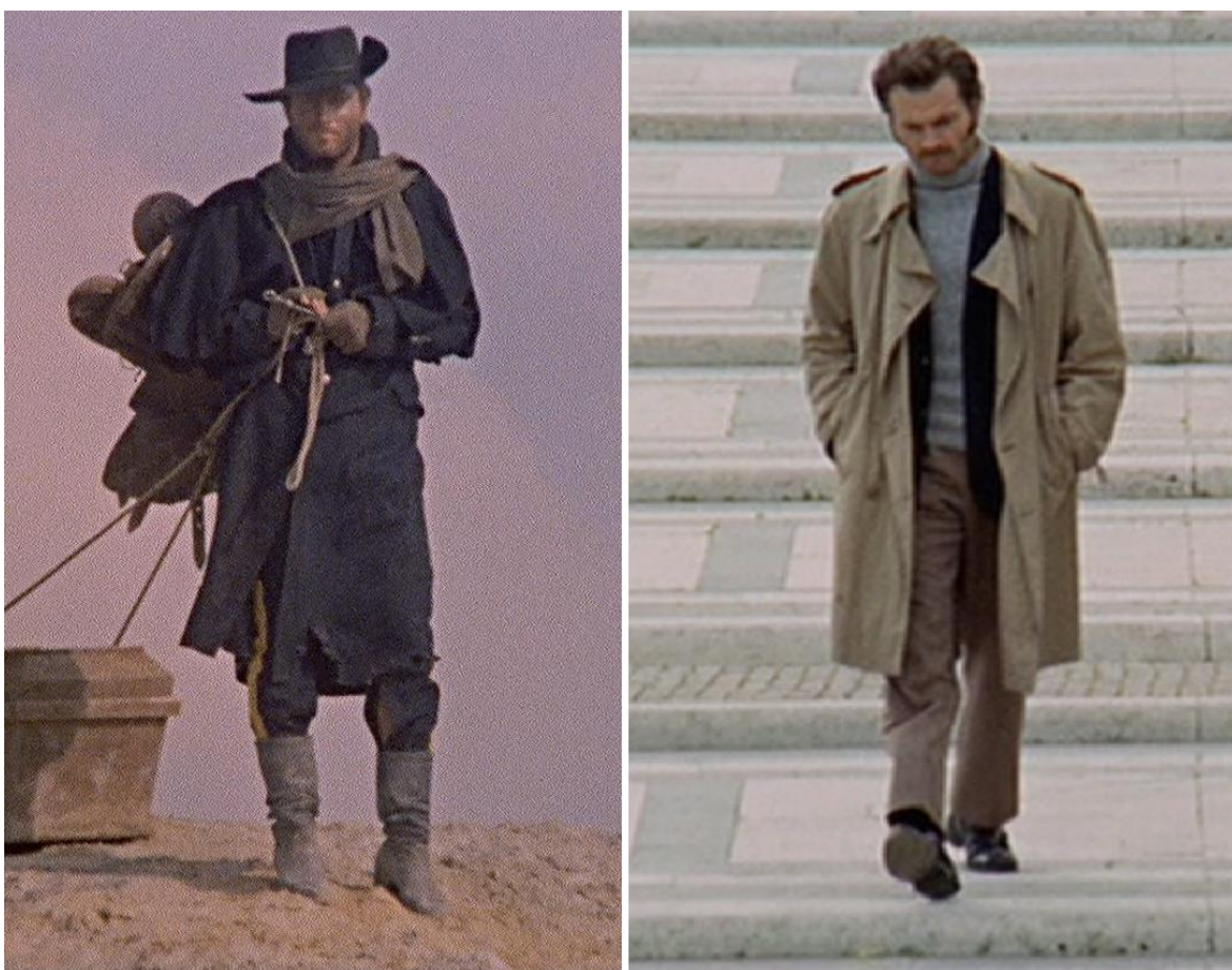
Figure 3.3 – Franco Nero as the eponymous antihero in the spaghetti western Django (left), and as another roaming outsider in The Fifth Cord (right).

sense that most M-giallo protagonists, no matter how uncomfortable they may be with their identity in a rapidly changing world, at least project an appearance of belonging within the environment they inhabit. David Hemmings' Marc Daly seems quite at home at the conservatory where he performs jazz music in Deep Red , while Sam Dalmas is content to live the life of the American loafer 'slumming it' in Europe while he awaits inspiration for his next novel. Nero, by contrast, seemingly captive to the character that defined his career, brings with him many characteristics associated with the spaghetti western protagonist which stand in stark contrast to those of the average M-giallo leading man. He is unshaven, scruffy and constantly wearing a weather-beaten trenchcoat, not unlike the ragged greatcoat he wears in Django (see Figure 3.3).