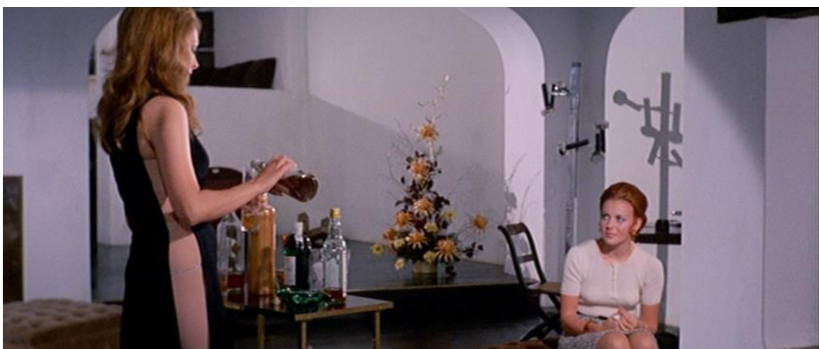
Figure 5.2 – Two examples of Dominique’s revealing outfits (left in both images) contrasted with Minou’s more conservative attire.

This ‘hyperfeminisation’ of queer women is not without precedent. Indeed, the horror genre is rife with representations of lesbians as attractive, sleek and highly sexual – images that, as Andrea Weiss points out, “easily lend themselves to heterosexual male fantasy” (1992: 76). As established in the previous chapter, rather than serving as an avatar for the viewer within the film world, the F-giallo central woman is typically positioned as a spectacle for the enjoyment of a male spectator. The same, too, is true of these films’ queer women, with the more assertive form of female sexuality they represent offering increased opportunities for them to be photographed provocatively, whether by virtue of their more revealing attire or their increased sexual activity (particularly when it involves other