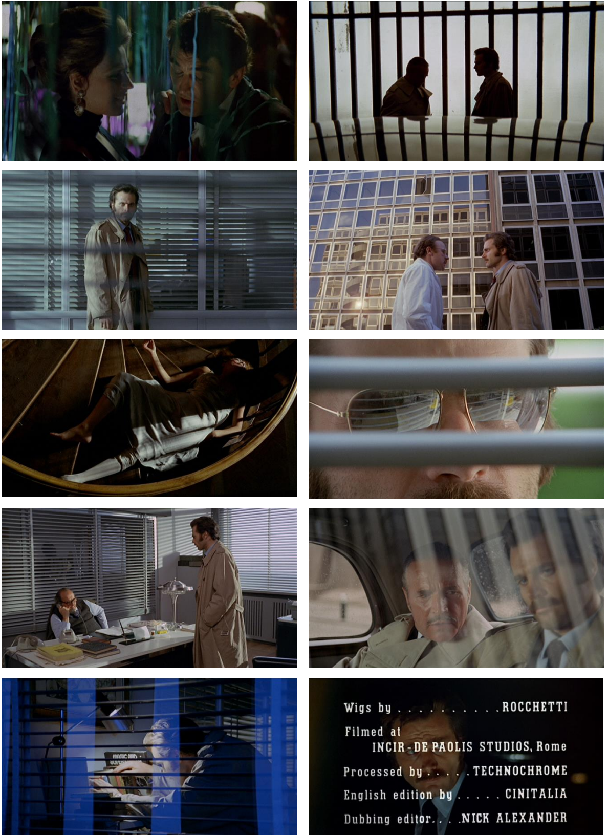
Figure 3.2 – The recurring motif of horizontal and vertical bars.

One aspect of the exterior scenes that is particularly striking is the film's apparent refusal to clearly identify the locations in which it takes place. Conventional establishing shots, setting up the geography of each location, are often avoided altogether in favour of going