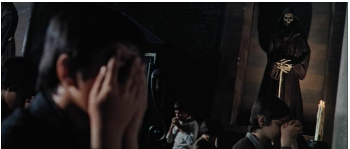
Figure 6.3 – Religious imagery as a harbinger of death.

It is worth acknowledging that killer priests are far from unusual in gialli . From a purely practical perspective, their black robes provide a convenient means of both outfitting the villain in the iconography of the traditional giallo killer and, with their close resemblance of women's dresses, disrupting the gender order. They are not so ubiquitous, however, that the fact that all three of this chapter's core texts feature a killer priest (either real or, in the