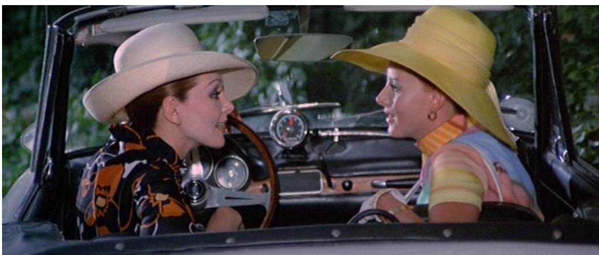
Figure 5.8 – The heterosexual coda subverted.

The hints that occur throughout the film regarding the nature of Dominique and Minou's relationship are reinforced in the final scene. While the denouement initially seems to set up a conventional heterosexual pairing between Minou and George, she swiftly parts company with him, claiming that she just wants to rest and promising to call him later, and then joins Dominique in her car. At this point, the two women, looking resplendent in matching summer dresses and sunhats, set off for Dominique's house to look at more pornographic photographs freshly arrived from Copenhagen. Minou's enthusiastic reaction, compared to her more muted and confused response to the same proposition earlier in the film, indicates that she has undergone a transformation of sorts. In short, she has been successfully 'seduced' by Dominique and has become more like her, evinced by their similar outfits (see Figure 5.8).