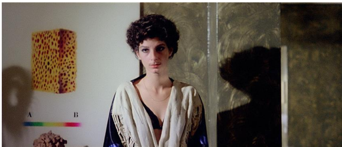
Figure 5.5 – Massimo, the transvestite in Deep Red .