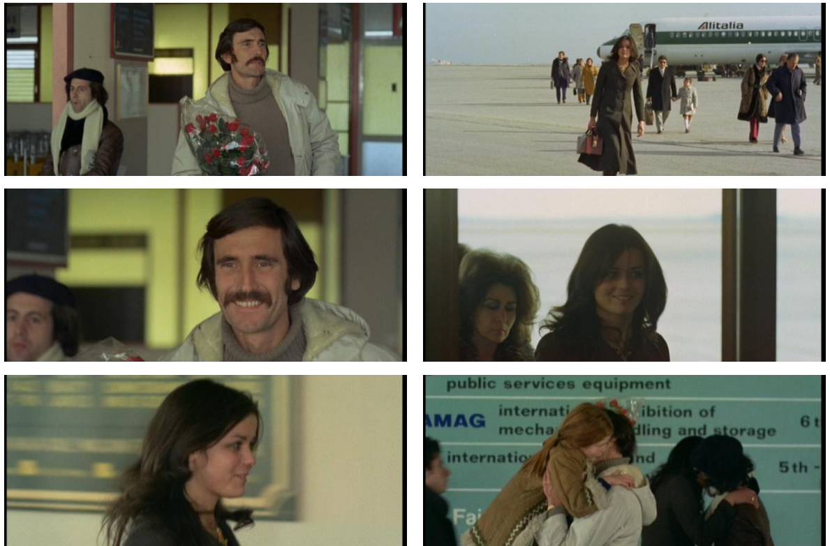
Figure 6.1 – Misdirection: the intrusion of a child disrupts a conventional adult heterosexual pairing.

I am not alone in my confusion. Various theories have been proposed as to why the scene is shot this way: for instance, Bengt Wallman suggests that it “tells us it is a mistake to trust anything at face value, especially vision” (2007: 46-47), while Mikel Koven argues that the scene is “playing with the audience’s expectations and assumptions, demonstrating the empathic and participatory nature of vernacular films like the giallo ” (2006: 59). While I do not disagree with the assertions of either author, I do not feel that they adequately explain what is happening in this scene. What makes the deception so strange is how seemingly unmotivated it is, lasting for all of thirty seconds and having no impact on the plot. There is literally nothing to be gained by implying a romantic union between Franco and the unidentified woman, or in initially concealing Roberta from the spectator. Surely if, as Wallman suggests, the intention is simply to emphasise that all is not as it initially seems in the giallo , the point is made far more effectively by the multiple red herrings and shocking revelations that occur in the murder investigation which follows.