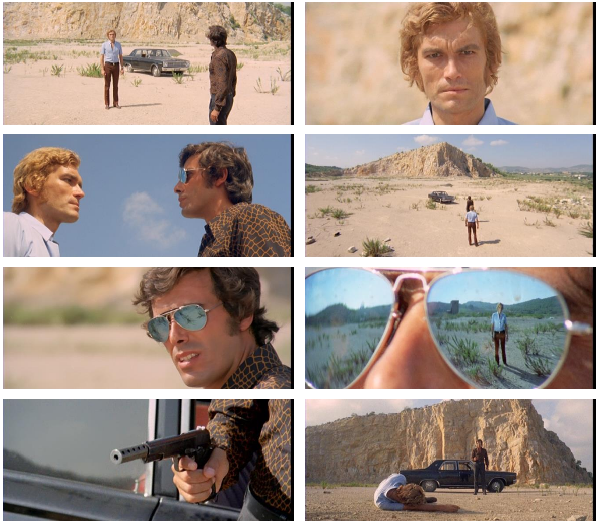
Figure 4.5 – Western iconography re-appropriated in the giallo .

This process is also evident on a lesser scale in Death Walks at Midnight , in which the climactic battle between the film's drug cartel villains and the male lead, Gio Baldi (Simón Andreu), takes place on the rooftops of Milan. Like the desert stand-off in Wardh , this sequence abandons the enclosed interior locales and bloody stabbings that have dominated the previous ninety minutes, instead emphasising the expansive open spaces afforded by the rooftop setting, along with kicks, punches and gunfire.