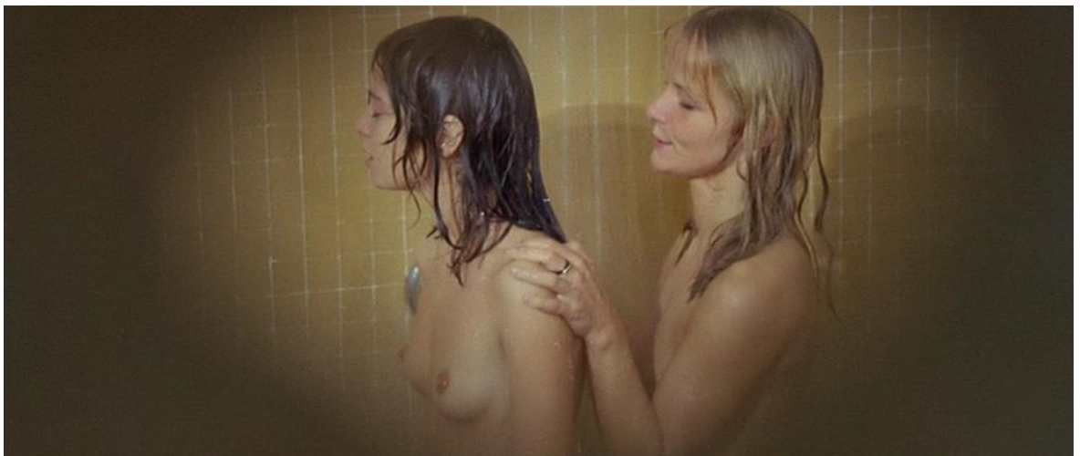
Figure 6.6 – The same girls shown in the first and second shower scenes.

It is in these scenes, and others in which the girls are placed in sexual situations, that Solange differs most noticeably from the other films discussed in this chapter. Solange has acquired a reputation for being sleazy, even within the context of the giallo 's already salacious nature, with even the girls' deaths having a leering quality absent from those of the children in Die and Duckling . This reveals an inherent contradiction between the film's readiness to exploit the girls' sexuality and its underlying morality. A desire to protect the girls from the outside world informs the actions of the film's parents and teachers – a form of alarmist 'think of the children' paranoia that is utterly at odds with the salacious manner in which the girls are characterised and photographed. In Duckling , this paranoia was also evident in the mass hysteria of the bloodthirsty mob that gathered outside the village police station, eager to avenge their murdered children by attacking the most convenient scapegoat. In Solange , crowds do not gather outside the police station to bay for Enrico's blood when he is taken into custody, but the father of one of the murdered girls is only too quick to berate the schoolteachers for their failure to "accept the fact that they have a sex