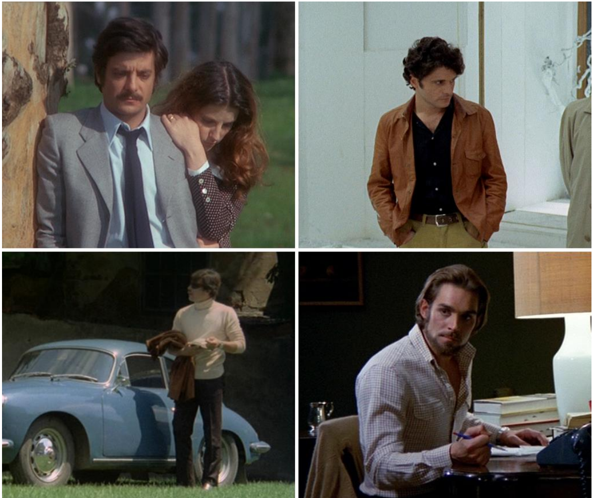
Figure 3.1 – Collage of M- giallo protagonists: Giancarlo Giannini in The Black Belly of the Tarantula , Tony Musante in The Bird with the Crystal Plumage , Jean Sorel in Short Night of Glass Dolls and Fabio Testi in What Have You Done to Solange?

trendy jet set culture that the gialli so readily embraced. Hilton, however, rarely played a protagonist in his own right, tending instead to be cast as the love interest (who often doubled up as the killer) in many an F- giallo , usually opposite Edwige Fenech. This role, which will be covered in Chapter 4 in my discussion of the F- giallo and its ‘central women’, fulfilled a very different function from that of the troubled M- giallo protagonist, which accordingly called for a different sort of screen presence than that of the self-assured ‘bad boy’ Hilton.