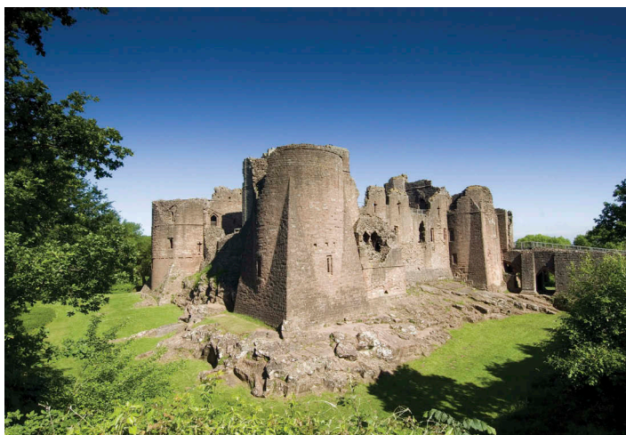
Figure 4. Goodrich Castle, Hereford