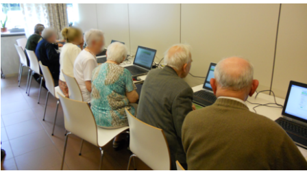
Figure 2: User evaluation of GRiST, one particular SMHS, with 12 participants

This user evaluation itself test took place in an adjacent room with notebooks installed and ready to start. Figure 2 gives an overview of the participants while performing the evaluation of the SMHS. Participants were asked to complete five basic tasks covering the most important goals and actions in the application: logging in with a specific username and password, filling out two different assessments, previewing their report, and checking their action plan. These tasks were written down on paper, so the participants could perform the tasks at their own pace.