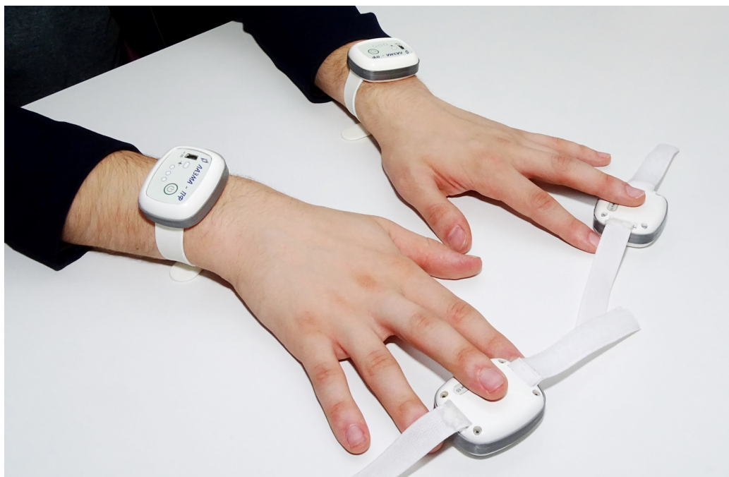
Figure 2. Location of the sensors

These areas were chosen because they represent two main skin types: glabrous and nonglabrous skin. Glabrous skin mainly covers the palms, soles and face. This skin type is primarily involved in body thermoregulation mechanisms. It contains a large number of arteriovenous anastomoses (AVAs) maintained in the constricted state by sympathetic tone. Thus, the sympathetic regulation is the dominant mechanism involved in the blood flow in the glabrous skin. 18 Nonglabrous or “hairy” skin covers almost the entire surface of the human body. It contains only a few AVAs, so that blood flow there is primarily nutritive in function. The reflex nervous regulation of this skin type involves both sympathetic noradrenergic vasoconstrictor nerves and separate sympathetic cholinergic vasodilator nerves. 19 The majority of studies devoted to age-related changes in microcirculatory blood flow was focused on the nonglabrous skin with less attention to glabrous skin sites.