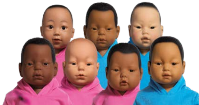
Figure 1: RealityWorks simulator dolls