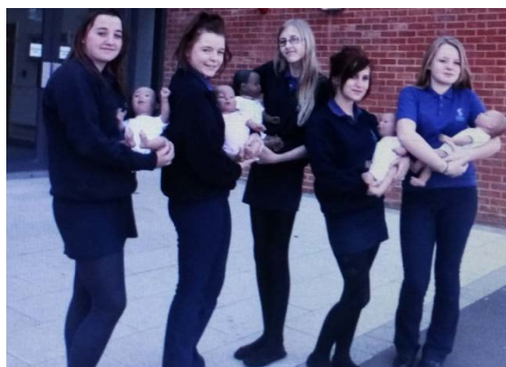
Figure 2: First Five KS4 pupils to take the VB doll home