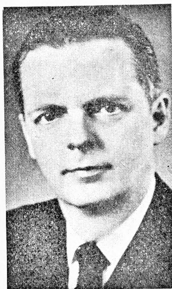
Governor William Stratton

Ed. Note:— If you wish to subscribe for someone else, turn to page three for application blank.