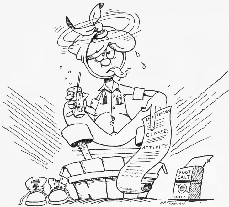
"DE FEET AFTER REGISTRATION DAY"