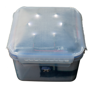
Figure 1: 1st Prototype Instrument

The effects of design constraints in prototype instruments were apparent, although the explicit focus in Wright's own research, which explored the design of sonic-play instruments with a small group of non-verbal young people on the autistic spectrum. Two prototype DMIs were developed over the process of this research. Both had a Skoog-inspired cuboid form factor, embedded loudspeaker, and embedded audio synthesis and LEDs using the BELA platform and SuperCollider [27]. The prototypes differed from one another in other respects, designed to target separate issues identified for the design of sonic-play instruments.