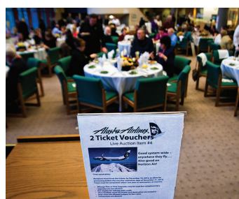
Two Alaska Airlines ticket vouchers; a coveted prize at the annual Alumni Auction!