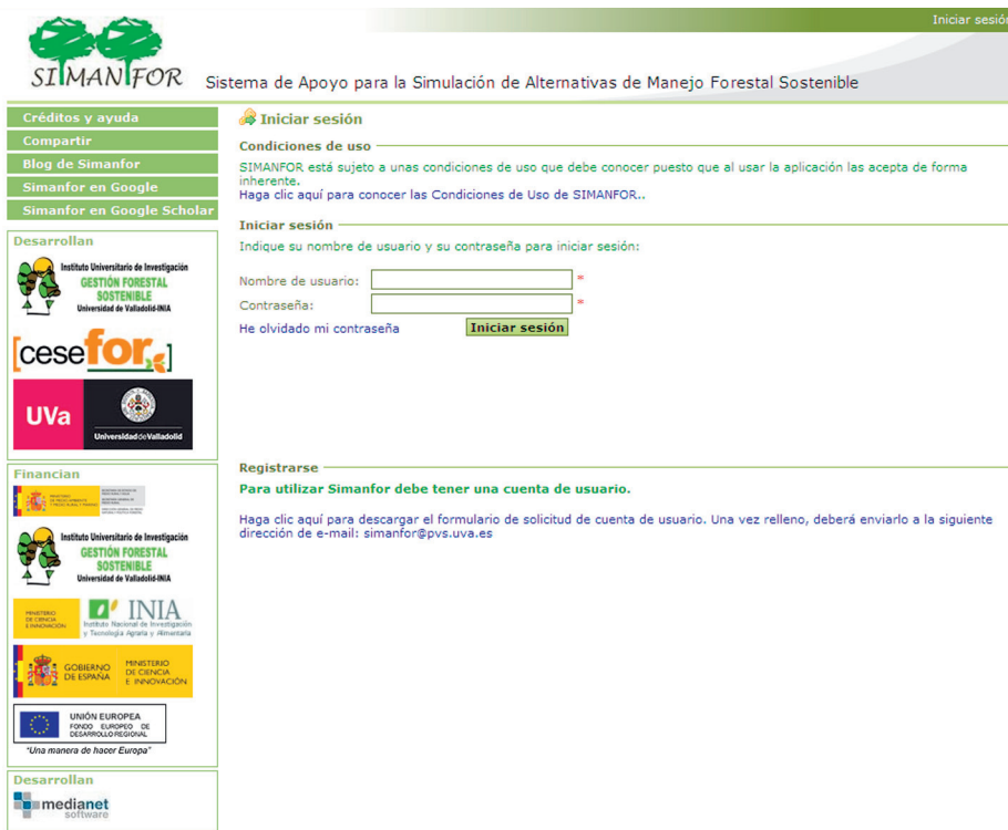
Figure 2. SIMANFOR access.

quested by e-mail (simanfor@pvs.uva.es) while a blog (www.simanfor.es/blog) provides solutions to the users' main problems.