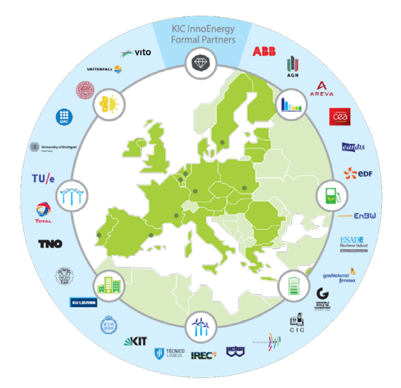
Figure 4. Kic InnoEnergy as an European network.

KIC InnoEnergy is a consortium of top European players from Industry, Research, Universities and Business Schools, with 27 shareholders (UPC among them) and additional 160 associate and project partners (Figure 4).