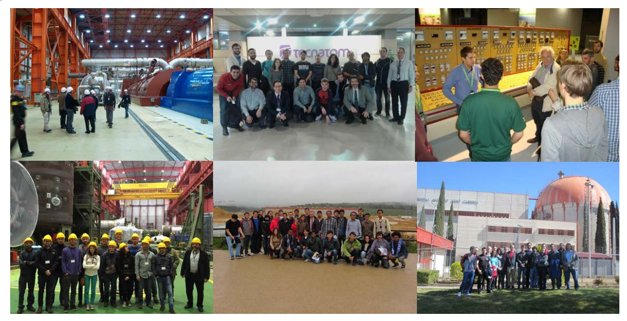
Figure 3. Images of some of the visits of the MNE students to industrial facilities. Top (left-to-right): Vandellòs-II NPP, Tecnatom Headquarters, Vandellòs-I graphite-gas reactor being decommissioned by ENRESA. Bottom (left-to-right): ENSA factory in Santander, ITER site in Cadarache, José Cabrera NPP being dismantled by ENRESA.

The list of companies involved in the Programme includes: Nuclenor (a company participated by Endesa that operates a BWR plant in Santa Maria de Garoña), ENUSA (a publicly traded Spanish company for design, manufacture and supply of fuel), ENRESA (a public company in charge of the safe management, storage and disposal of the radioactive wastes produced in Spain), ENSA (a State owned company specialized in the manufacturing of heavy equipment), Tecnatom (advanced engineering), IDOM (engineering company), Westinghouse and AREVA. These companies participate in different ways, either facilitating that their professionals lecture some specific topics, opening internship positions, or offering guided visits to their facilities (see Figure 3).