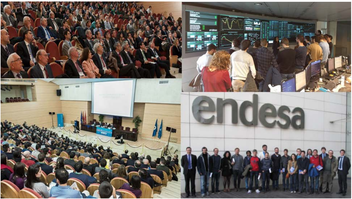
Figure 2. Images of MNE students in their visit to ENDESA and during a Seminar on Operating Experiences and Perspectives. Left: Seminar of Spanish Nuclear Society in Madrid in 2015. Right-bottom: visit to Endesa Headquarters the day before the Seminar. Right-top: visit to the Generation Control Center during the visit of 2016.

Endesa makes it possible the attendance of MNE students to an important annual event of the Spanish Nuclear Society in Madrid (the Seminar on Operating Experiences and Perspectives, where the Spanish NPPs managers expose the operation of their plants during the previous year), by means of sponsoring the simultaneous translation of the event into English. To take advantage of the trip to Madrid, Endesa invites the students to visit its Headquarters, where the future nuclear engineers have the opportunity to exchange some words with the managing director of Endesa's Nuclear Division and a guided visit is arranged to the Generation Control Center (Figure 2).