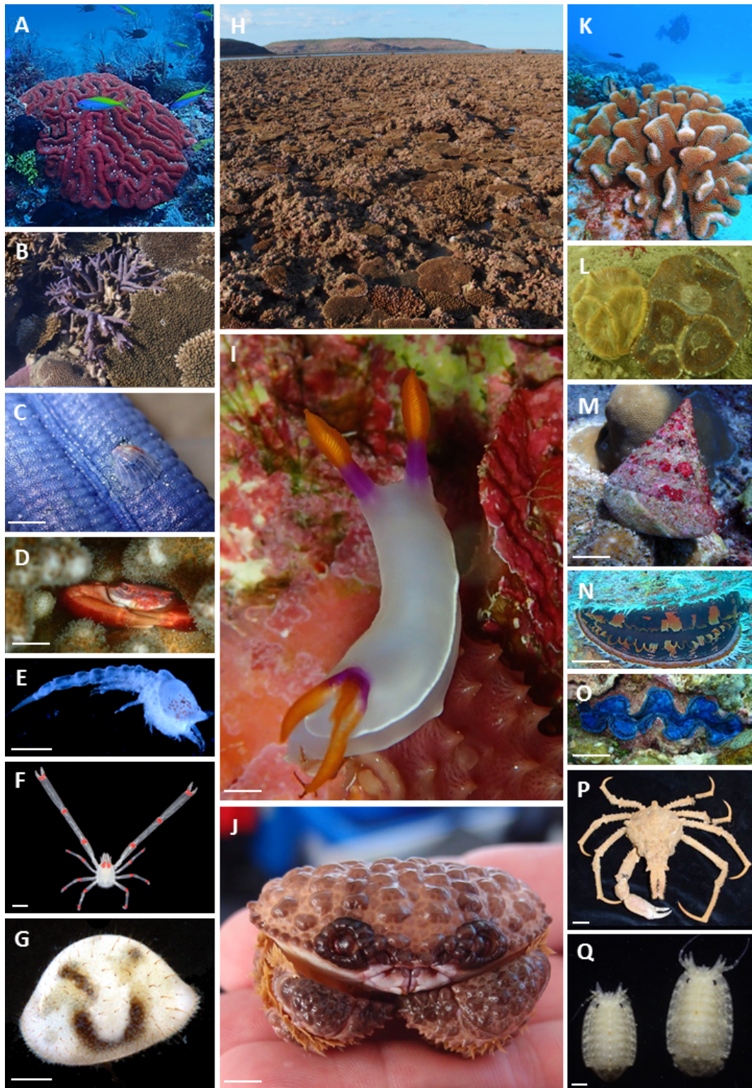
Figure 3. Compendium of select marine invertebrate fauna from the North West Shelf. A. Lobophyllia hemprichi at Ashmore Reef, B. Intertidal Acropora assemblage in the Kimberley, C. The ectoparasitic gastropod Thyca crystallina on blue seastar Linckia laevigata from Imperieuse Reef, Rowley Shoals. Scale = 5 mm, D. Trapezia cymodoce in Stylophora pistillata at the Montebello Islands. Scale = 10 mm, E. An interstitial cumacean from Montgomery Reef. Scale = 1 mm, F. Uroptychus sp. nov. from Rob Roy Reef. Scale = 10 mm, G. A benthic ostracod from Montgomery Reef. Scale = 1 mm, H. A diverse intertidal coral community at Patricia Island, Bonaparte Archipelago, Kimberley, I. Hypselodoris nudibranch from Imperieuse Reef, Rowley Shoals. Scale = 4 mm, J. Daira perlata from the Kimberley. Scale = 5 mm, K. Pocillopora grandis at Browse Island, L. Moseleya latistellata in the soft sediment at Dampier Archipelago, M. Rochia nilotica from Scott Reef. Scale = 30 mm, N. Spondylus clam from Imperieuse Reef, Rowley Shoals. Scale = 50 mm, O. Tridacna from Mermaid Reef, Rowley Shoals. Scale = 50 mm, P. Paranaxia keesingi a newly described species from NW WA. Scale = 30 mm, Q. Agostodina munta from the Montebello Islands. Scale = 5 mm.