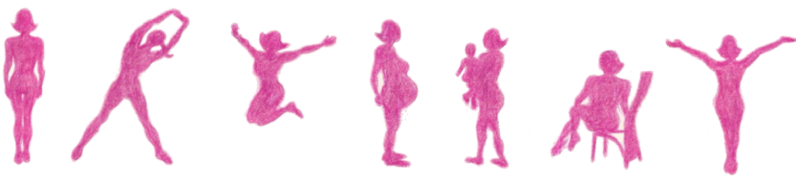
1. Stretches recommended for pregnant women

There are many physical changes to a pregnant woman's body: the core changes, there is more pressure on the organs and there is increased weight to be carried. All of this in a short period of time often leads to back pain, pelvic pain and urinary incontinence. Our research shows that group training programs designed and delivered by physiotherapists can relieve the most common problems pregnant women have.